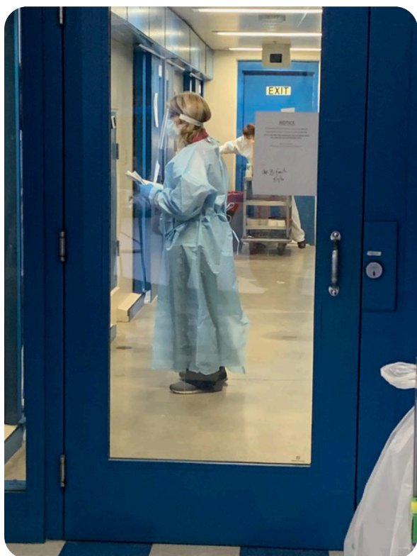
Washington State Office of the Correctional Ombuds, Monitoring Visit to Monroe Correctional Facility, Medical isolation unit with COVID-positive individuals, April 10, 2020

Washington Office of the Corrections Ombuds (OCO): The OCO has continued facility visits throughout the coronavirus pandemic, conducting thematic inspections to determine how prisons are responding and adapting to the crisis. OCO staff conducted these visits, using personal protective equipment, in response to concerns in specific prisons about COVID-related conditions and the implementation of safety and sanitation procedures. The first inspection after the COVID breakout took place on April 10, 2020, following a mass disturbance resulting from tensions surrounding fear of the spread of the virus. The OCO has published reports on each of the facility visits, including its findings about the disturbance and the steps the agency is taking to protect incarcerated people during the COVID crisis.