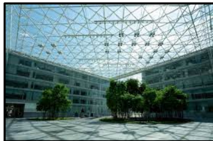
Figure 2: The Thurgood Marshall Judicial Center, Washington, D.C.

It is time to reconsider whether the edifice that is the class action settlement process continues to need the array of costly flying buttresses to externally support the approval outcome and provide light inside the settlement cathedral. The judicial settlement approval process no longer needs the compressive strength that external experts provide. In the latter part of the twenty-first century, judges have modern procedural and administrative materials more than sufficient to provide the tensile strength to independently sign off on the agreement that is at the centerpiece of the modern aggregate litigation.