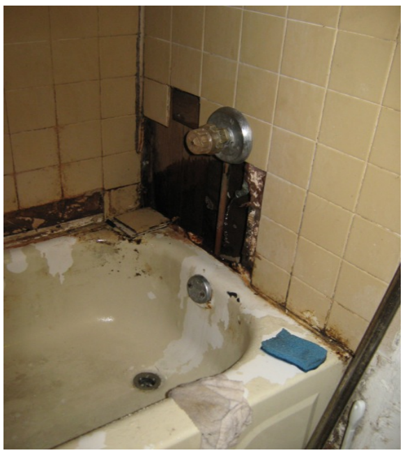
Missing tiles, rotting wall, mildew, and mold.