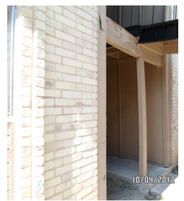
Sagging horizontal member beam and bowing support post not strong enough to carry imposed load.