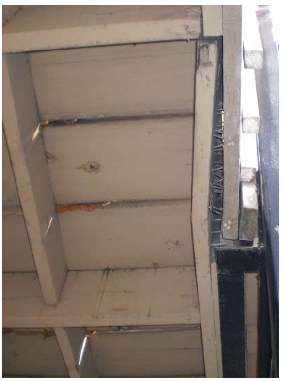
Second floor walkway becoming detached from support posts and at risk of collapsing.