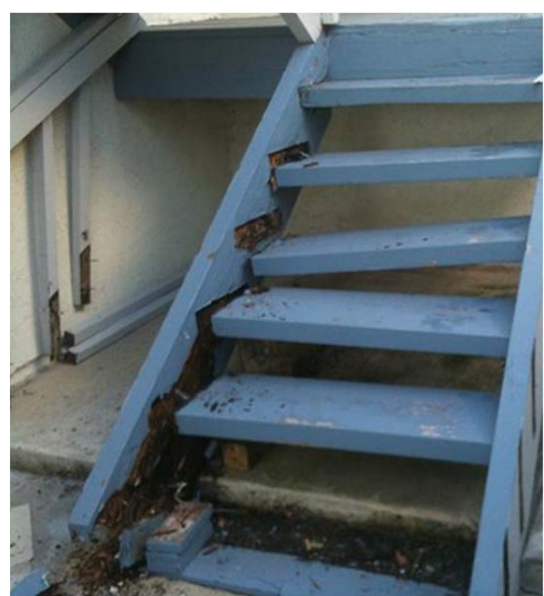
Rotting stairway missing treads, handrails, and guards.