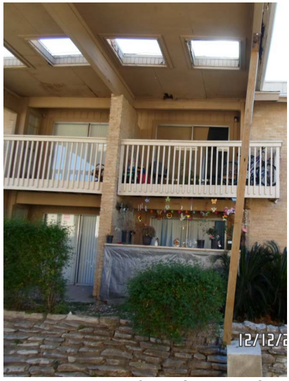
Post supporting roof is inadequate with risk of roof collapsing.