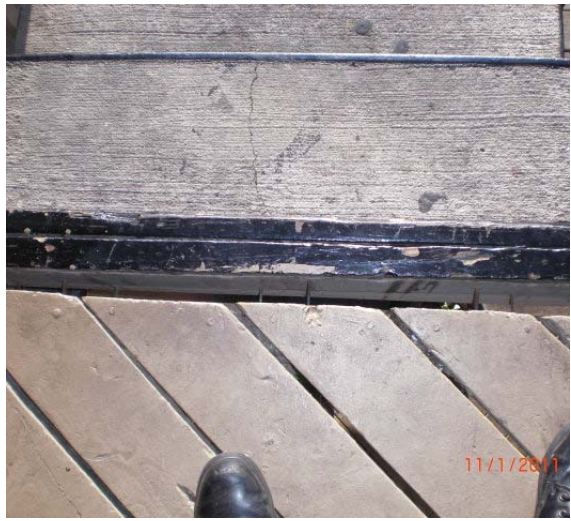
Stairway being held up only by nails and pulling away from walkway.