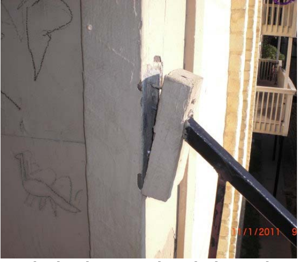
Handrail no longer anchored adequately and pulling away from structure.